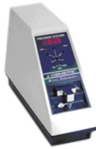
Freezing Point Osmometer 5004 MICRO-OSME