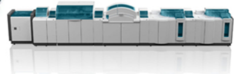
Modular analyzer Cobas 8000 system_c702