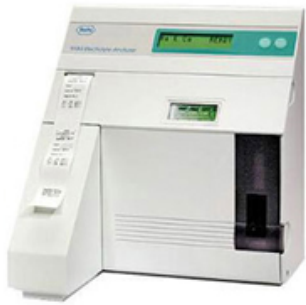
Electrolyte Analyzer Roche 9180