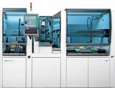
Pre-analytical system Cobas p612