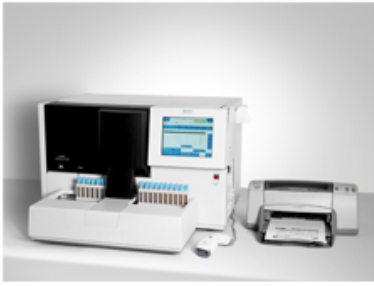
Blood Coagulation Analyzer CA-1500