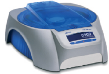
Digital centrifuge GRIFOS DG SPIN