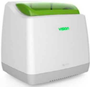
ESR Analyzer VISION-C