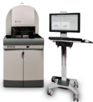
Hematology analyzer UniCel DxH 800