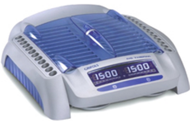
Digital Incubator GRIFOS DG THERM