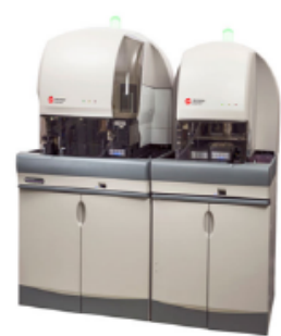
Hematology analyzer UniCel DxH 801