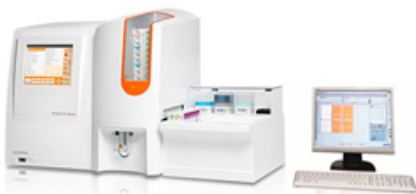
Hematology analyzer Pentra_DF Nexus

, , , , . (HbA1c) , (lymphocyte subset, PNH Study),