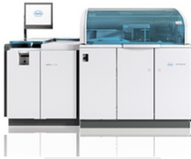
HbA1c Analyzer cobas C513