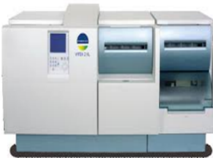
Microbial identification system VITEK2 XL