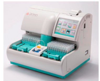
Automated blood analyser OC-DIANA