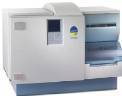
Microbial identification system VITEC 2