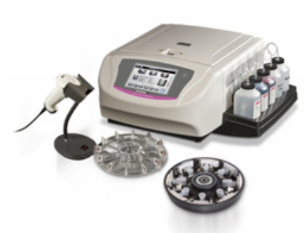
Automated Slide stainer Aerospray TB Slide stainer