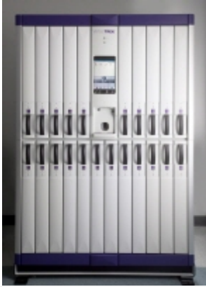
Automated Microbial Detection System VersaTREK™