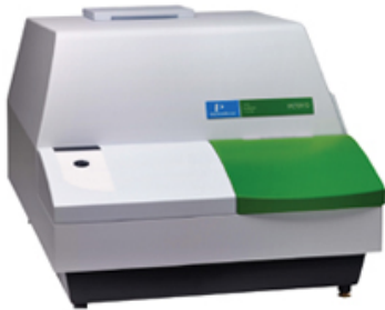
Newborn screening system VITOR 2D