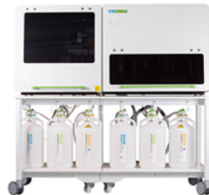
Neonatal screening system Auto DELFIA