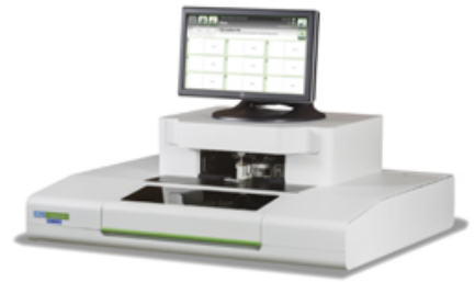
Dried sample punching device DBS Puncher