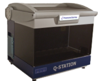
Immunoblot Analyzer Q-station Elite