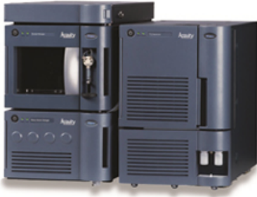
UHPLC tandem mass Acquity TQD