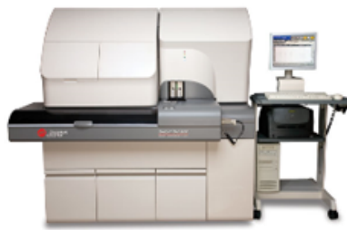
Prenatal Screening system UniCel® DxI 800